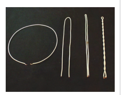
Figure 1 Each loop of wire is the same length, yet they each have inductances, from left to right, of 730, 530, 330, and 190 nH.

I mention this simple experiment because I have all too often heard engineers say: "My via has an induc-