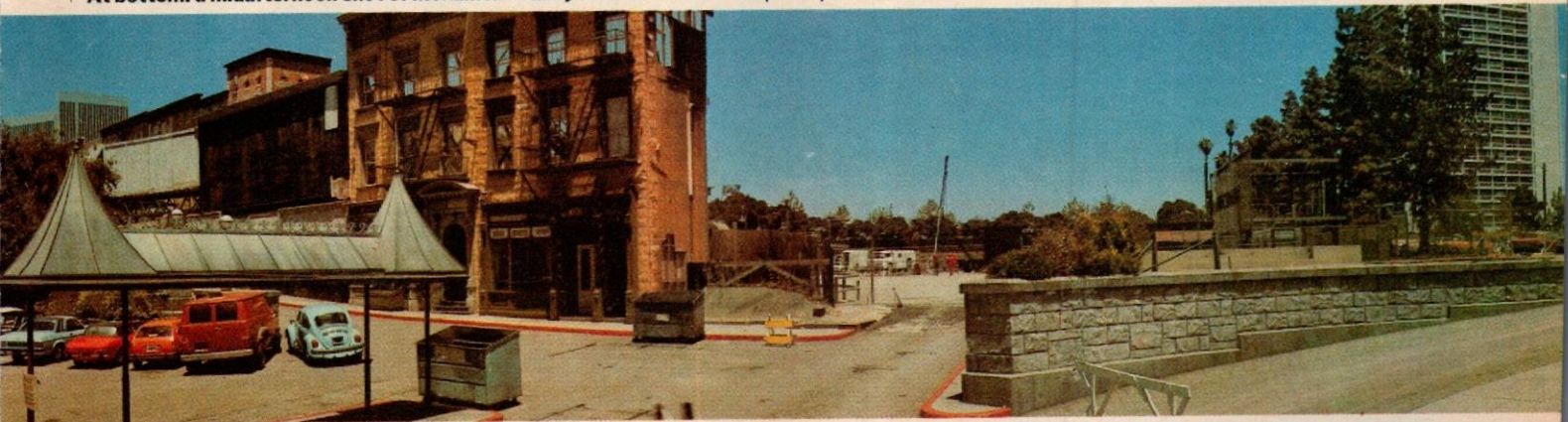
At bottom: a midafternoon shot of Monument Valley in Arizona and Utah (210°). Above: a 190° sweep of 20th Century-Fox back lot