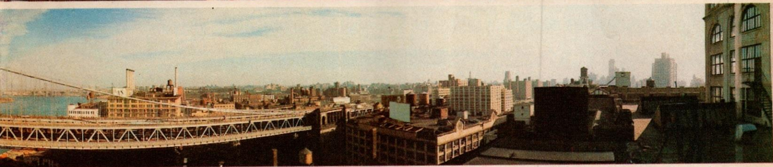
Top: Chicago's lakefront in a 1977 panorama spanning 210°. Below: Manhattan Bridge seems to curve toward Brooklyn in a 1974 picture

mechanism, while its film is moved at the same speed past its aperture.