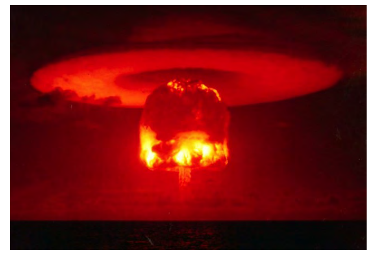
Radioactive clouds at the Bikini Atoll on May 21, 1956: