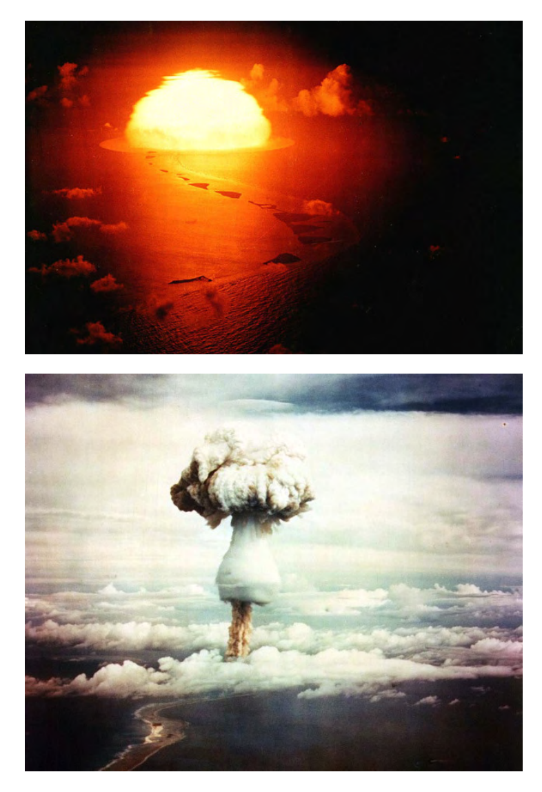
"Ivy Mike," the first test of a thermonuclear weapon, on October 31/November 1, 1952:

Explosion of "George," the third of the four explosions during Operation Greenhouse, on May 9, 1951: