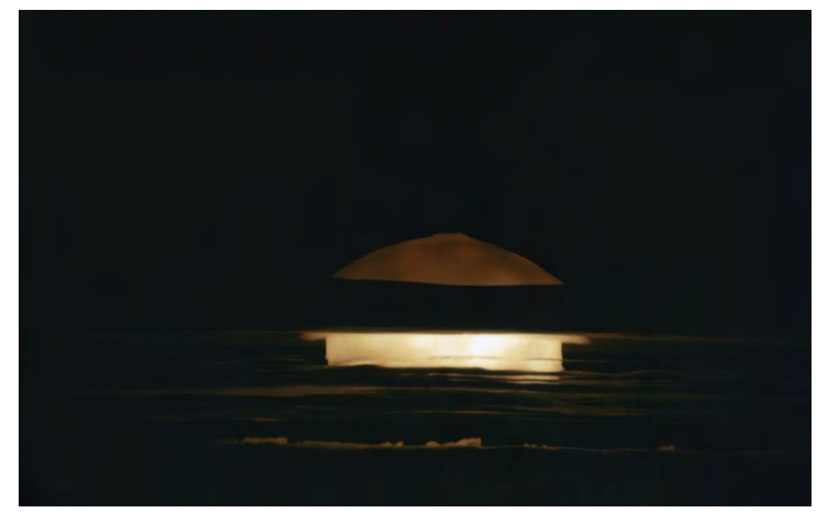
"Licorne," a test of a 914 kiloton thermonuclear bomb in the Mururoa Atoll, French Polynesia, July 3, 1970: