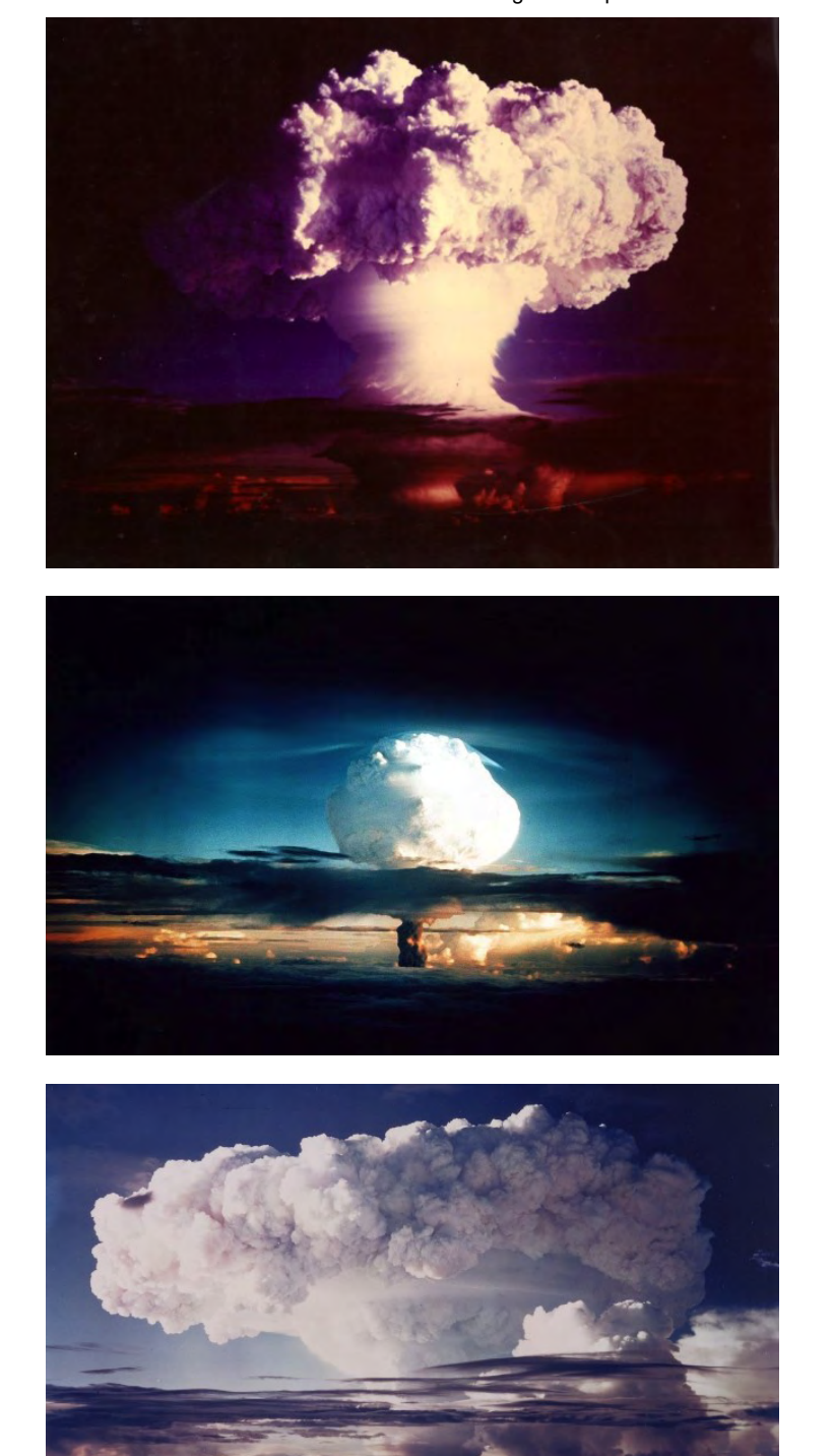
"Ivy King," the detonation of a very high yield pure-fission bomb, November 15, 1952: