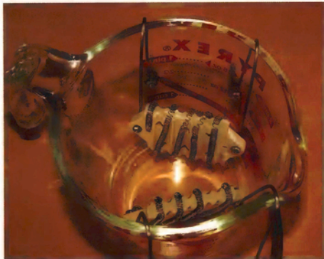
The amplifier test load is formed by two slightly modified electric jug elements suspended in a jug of cooling water. This load can sink very large power outputs – if the water starts getting hot, simply swap it for some cold water.

You can also make 2Ω and 4Ω loads, just by modifying the above procedure.