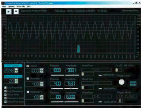
Fig.2: this audio frequency generator software is available for a 30-day free trial period via a web download. Just about any frequency generator software is suitable for the amplifier testing procedure described in this article.

The signal-to-noise ratio is a measure of how quiet an amplifier by itself is: for example, when all the sound stops, you shouldn't be able to hear anything – no hiss and no hum. Well, not because of the amplifier, anyway.