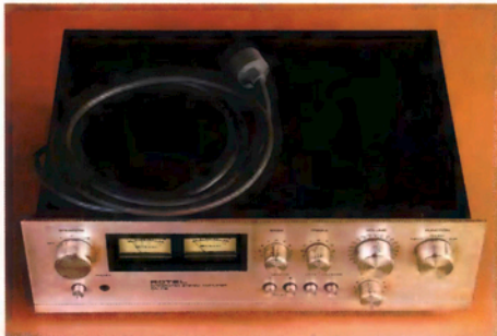
This secondhand amplifier – bought for just $8.00 – was the guinea pig for much of the testing described here. Using just simple tools and techniques, its power output, frequency response and signal-to-noise ratio were all measured, along with the response of its tone controls.

Alternatively, you can make each element 4Ω and then wire them in series for an 8Ω load. It really doesn't matter how you do it – you just want lots of windings and a resistance that matches the load the amplifier expects to see.