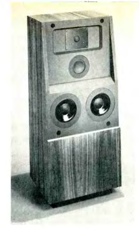
Fig. 2—The Sonex Model Two Loudspeaker System. This system uses two small bass drivers with a passive radiator in the rear for fast response. The physical offset between the bass and midrange drivers is less than between the drivers in Fig. 1.

Since there are both physical and electrical methods available which can be used to properly adjust the acoustical position vs. frequency and therefore the Time-Alignment™ of acoustical output of a multi-way loudspeaker system, it is worthwhile to look at some different loudspeaker systems which are Time-Aligned™. Figure 1 is a photograph of three Time-Align™ loudspeakers, manufactured by Sonic Energy Systems. The smallest, the TA-10, on the right, is a Bookshelf system employing a 25 cm (10 in.) woofer and a 3.8 cm (1.5 in.) tweeter. The physical offset between the woofer and tweeter in this system is less than that of the woofer and the midrange of the TA-12, shown as the