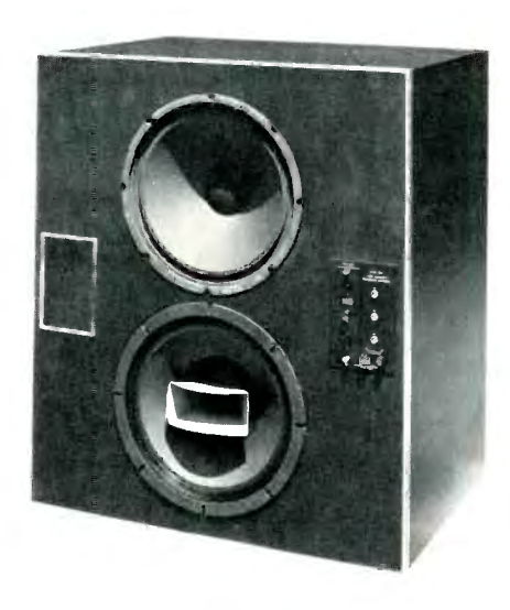
Fig. 3—The UREI Model 813 Time-Align™ Monitor for use in studio control rooms. The 604-8G high and low frequency drivers are locked together and are, therefore, Time-Aligned™ by a passive time delay plus crossover network.

(15in.) woofer in this system also receives its signal via a time delay/crossover network. Besides offering the 813 Time-Align™ Monitor as a complete system, UREI also supplies Time-Align™ crossover networks for the Altec 604-8G and the older 604-E.