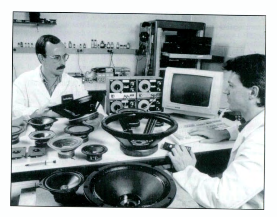
Figure 1. Audio engineers run a vast array of speaker tests, free to customers. Damping, heat transfer, impedance and ferrofluid compatibility are checked.

Tweeters and midranges are the most commonly known recipients of ferrofluids. If a ferrofluid is too viscous, then the top-end response of the tweeter