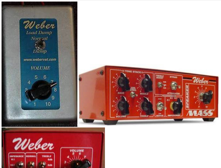
Searching for volume control boxes?